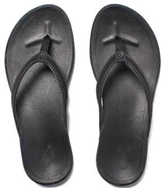
HO'ŌPIO, Onyx $65

No matter where you live, it's easy to add an island vibe to your summer adventure. Bring the spirit of the islands to every summer day with ultra-comfortable colorful sandals that will inspire you to live aloha .