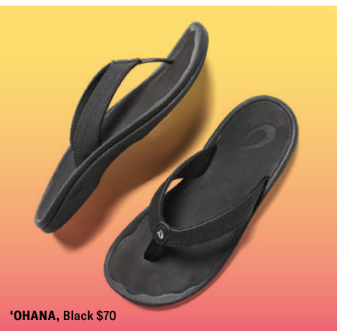
'OHANA, Black $70