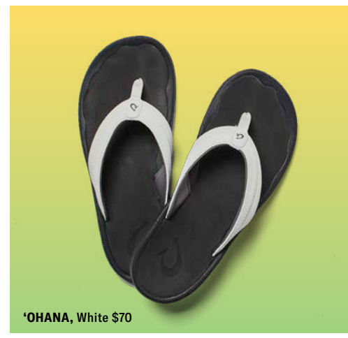
'OHANA, White $70