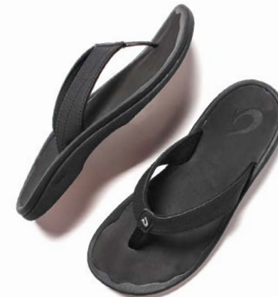
'OHANA, Black $70