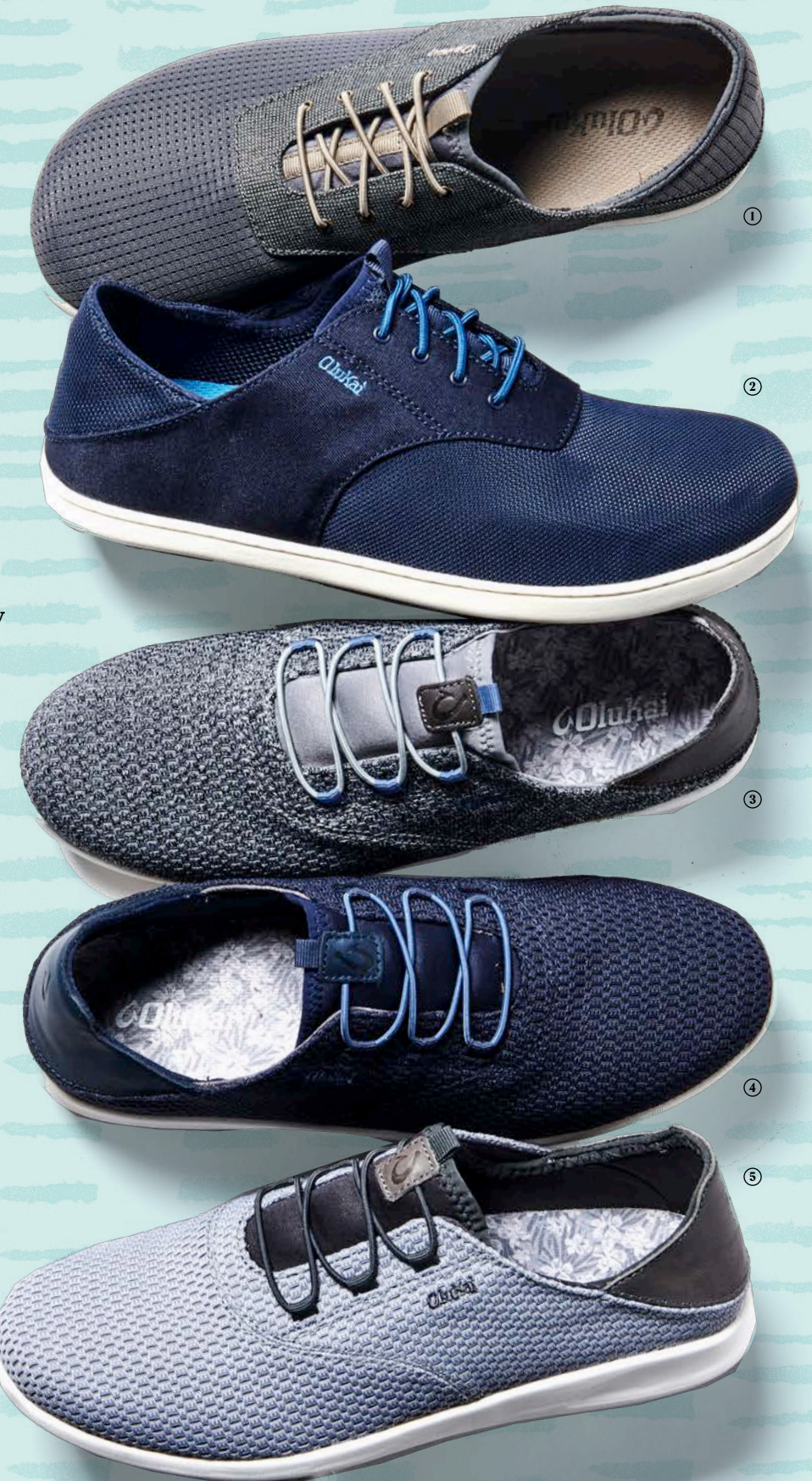
On Kamu: NOHEA MOKU, Dark Shadow

'Ālapa Lī (ah-lah-pah lee) Translation: Active, Lace — POI $100