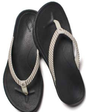
HO'ŌPIO, Bone/Stripe $65