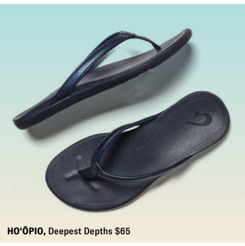
HO'ŌPIO, Deepest Depths $65