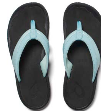
'OHANA, Sea Glass $70