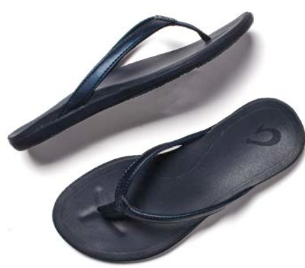
HO'ŌPIO, Deepest Depths $65