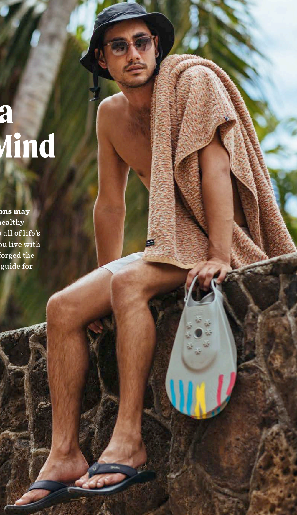
On Taylor: 'OHANA, Blue Depth

Although summertime vacations may have turned to staycations, a healthy dose of aloha brings positivity to all of life's journeys, big and small. When you live with aloha , you'll find the spirit that forged the Hawaiian Islands can serve as a guide for your daily life.