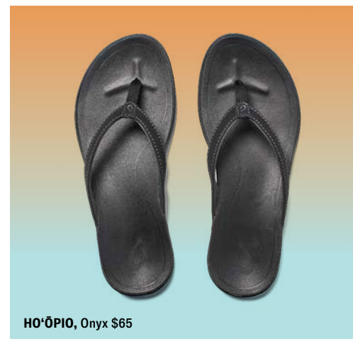
HO'ŌPIO, Onyx $65

'Ohana (oh-hah-na) Translation: Family — 'Ohana is made for family beach days with boards and barbecues. It's the ultimate beach sandal designed to handle everything the shoreline has to offer. — PETAL PINK $70 BLUEBERRY $70