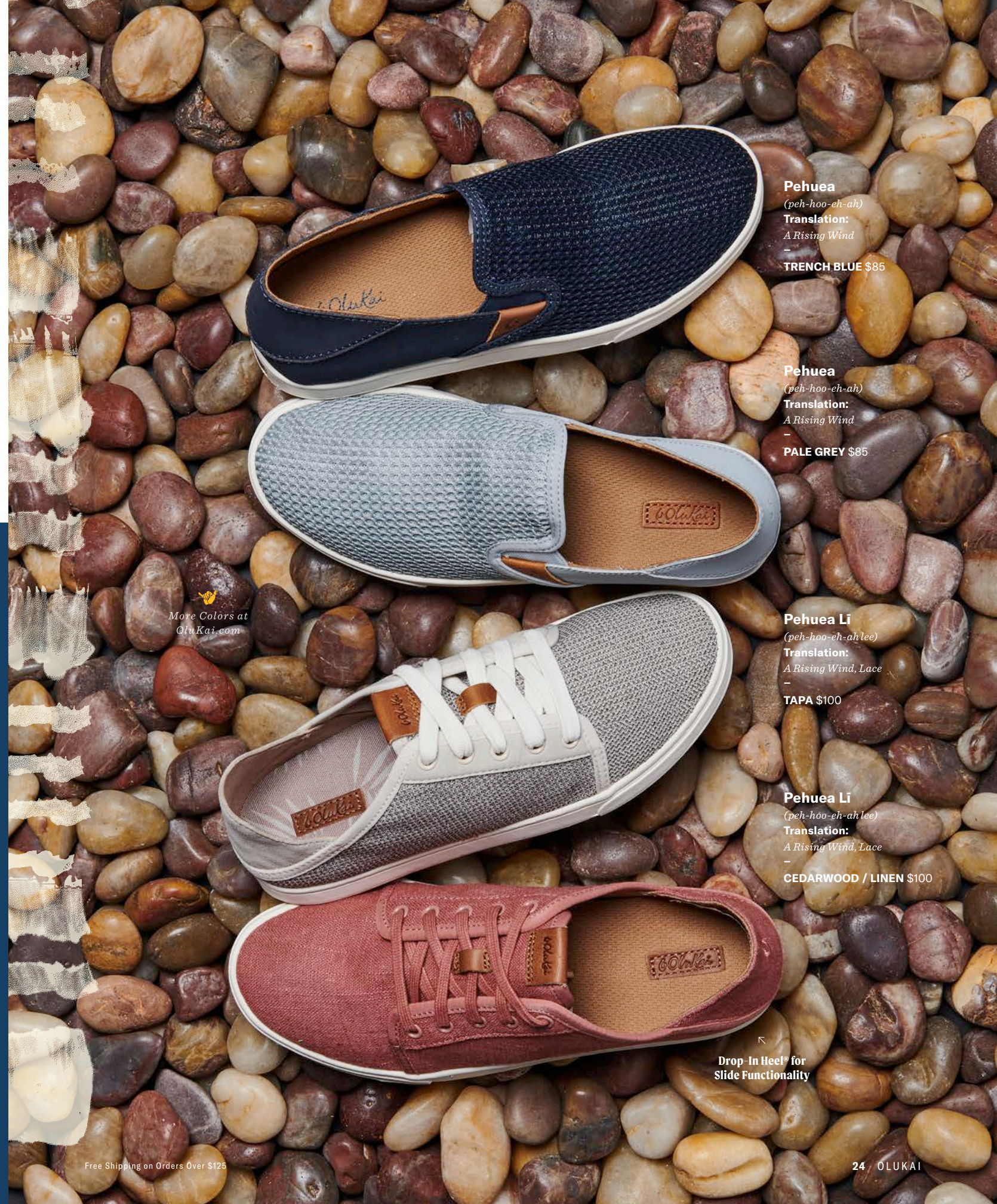
Pehuea (peh-hoo-eh-ah) Translation: A Rising Wind — TRENCH BLUE $85