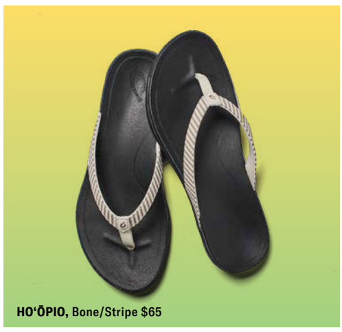
HO'ŌPIO, Bone/Stripe $65