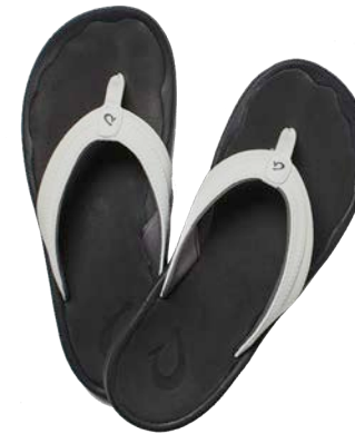
'OHANA, White $70