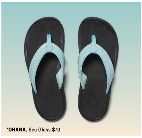
'OHANA, Sea Glass $70